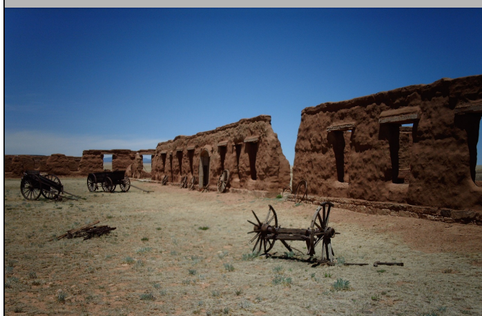
Fort Union on Santa Fe Trail